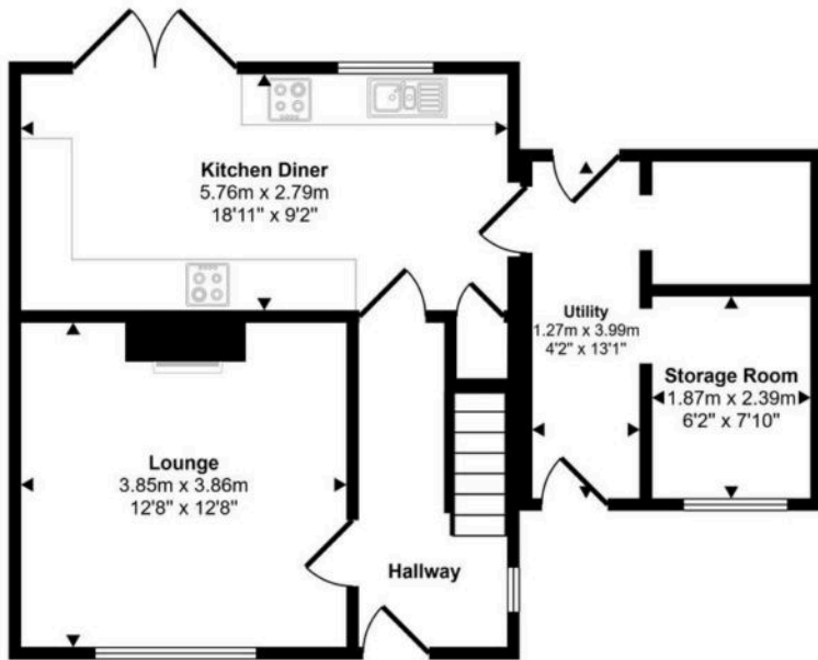
Ground Floor Approx 53 sq m / 575 sq ft

Approx Gross Internal Area 93 sq m / 1004 sq ft