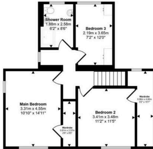
First Floor Approx 59 sq m / 632 sq ft