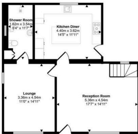
Ground Floor Approx 66 sq m / 706 sq ft

Approx Gross Internal Area 139 sq m / 1497 sq ft